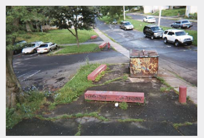
Built environment: neighborhood decay (7/2009) "In our neighborhood, we saw eyesores, such as bad-smelling dumpsters that make us unhappy. These discourage us to exercise in our neighborhood." (photo by Monica Little)

"We walk to exercise our bodies, but we would like it better if there weren't any gangs to mess up our streets." (reflection and photo by Vilma Padilla)