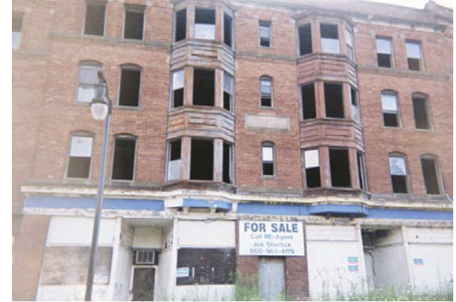
Built environment: vacant buildings (7/2010) "I took this picture to show everyone that we have a lot of abandoned buildings that our parents pay taxes on, that we can fix up and build more high schools and other useful buildings." (reflection and photo by Veronica Simon Tirado)